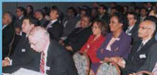
A cross section of the Delegates and Guests in attendance at the Opening Ceremony.