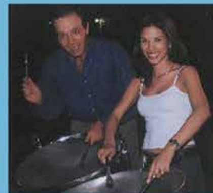
Delegates tried their hands at playing the national instrument of Trinidad and Tobago, the Steelpan.