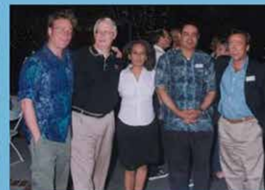
An evening of entertainment held at the Pier 1 Chaguaramas in honour of delegates.